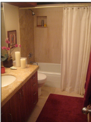
Client Bathroom Before